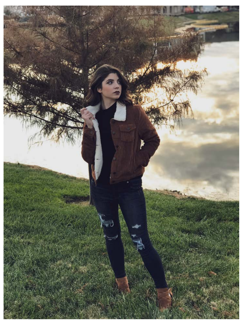
Lose the layers and stay fun, cute, and light in wool.