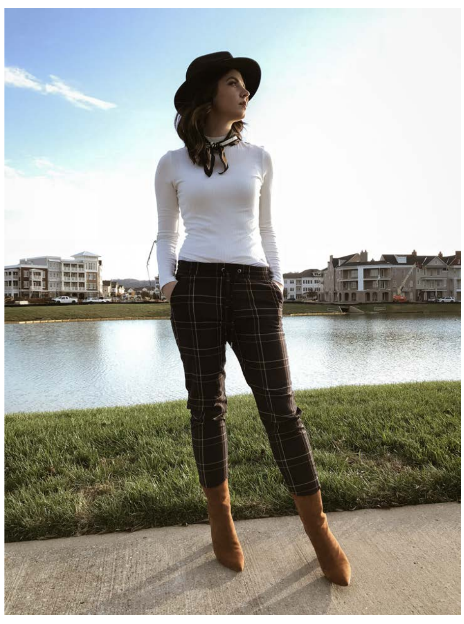
Seize the day by adding a French neck scarf.