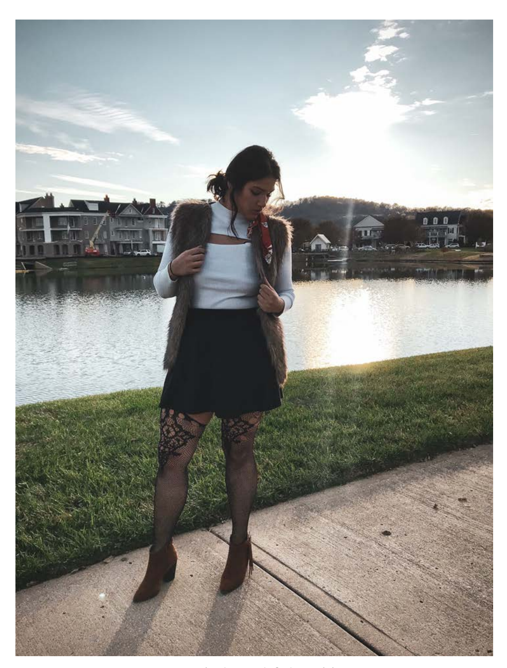
Bring your wardrobe to life by adding texture.