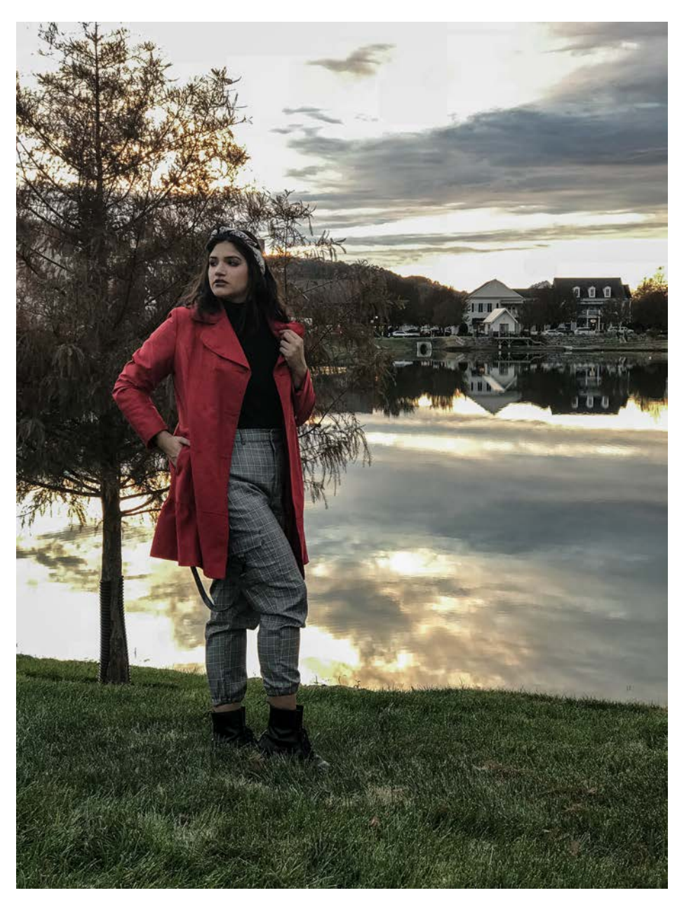
Make your statement.